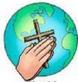
World Mission Sunday

We will have a second collection next week for World Mission Sunday. In 1926 Pope Pius XI instituted Mission Sunday for the whole Church with the first worldwide Mission Sunday collection taking place in October 1927. The Mission Sunday collection is always taken on the next to last Sunday during the month of October. That day is celebrated in all the local Churches as the feast of catholicity and universal solidarity so Christians the world over will recognize their common responsibility with regard to the evangelization of the world.